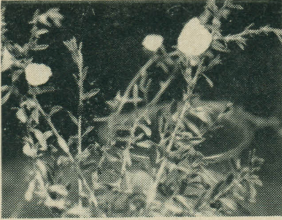
Fig. 1. The plant Convolvulus pluricaulis-chois in its flowering phase.